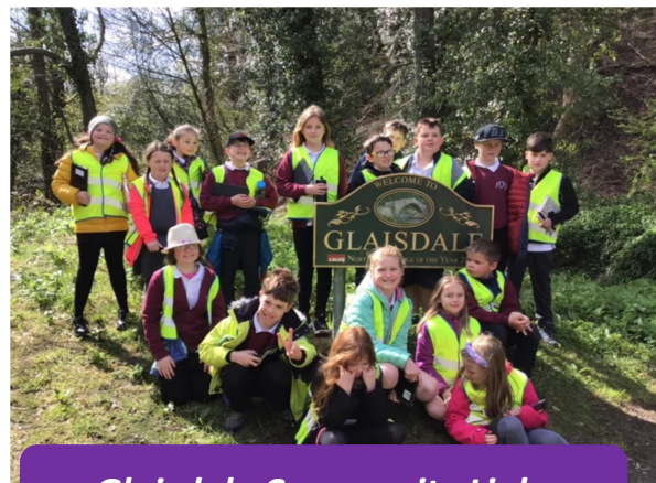
Glaisdale Community Links

We were also delighted to have the opportunity to collaborate with staff from the North York Moors National Park, taking on board their experience and knowledge whilst we develop our bespoke 'moors school' curriculum. Plans are still in their infancy but we're very excited by the prospect of using local heather to make besoms, carrying out conservation activities and taking part in dark skies tours.