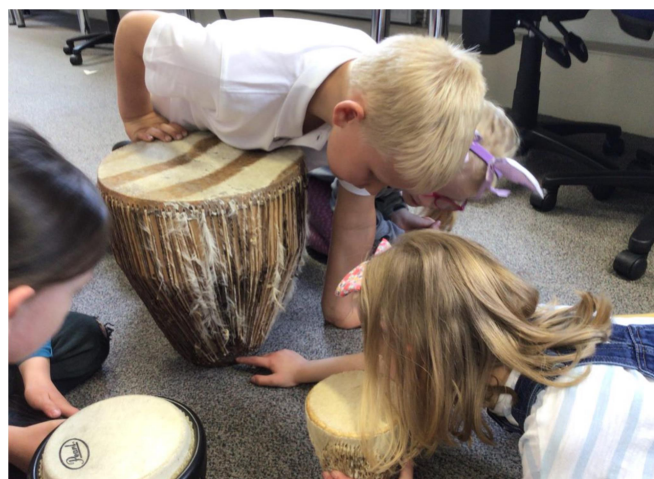
Kenyan themed music sessions at Castleton

The final stage of the award will involve all children coming together to celebrate their discoveries with each other. Oak class will also be writing reflections about what they have learned in their log books. On completion and submission, all children will receive an Arts Award Discover certificate from Trinity College, London.