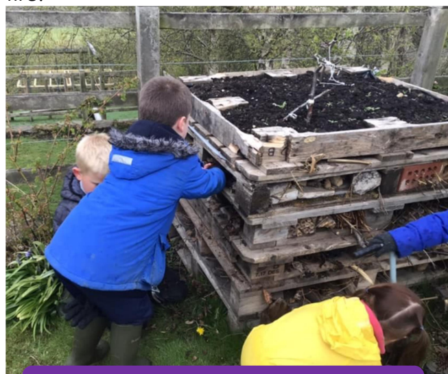
Castleton's Mini-beast Mansion

Recent activities have included using tools to make bird boxes and woodland mobiles, climbing trees, building dens and – everyone's favourite – drinking hot chocolate by a roaring fire!