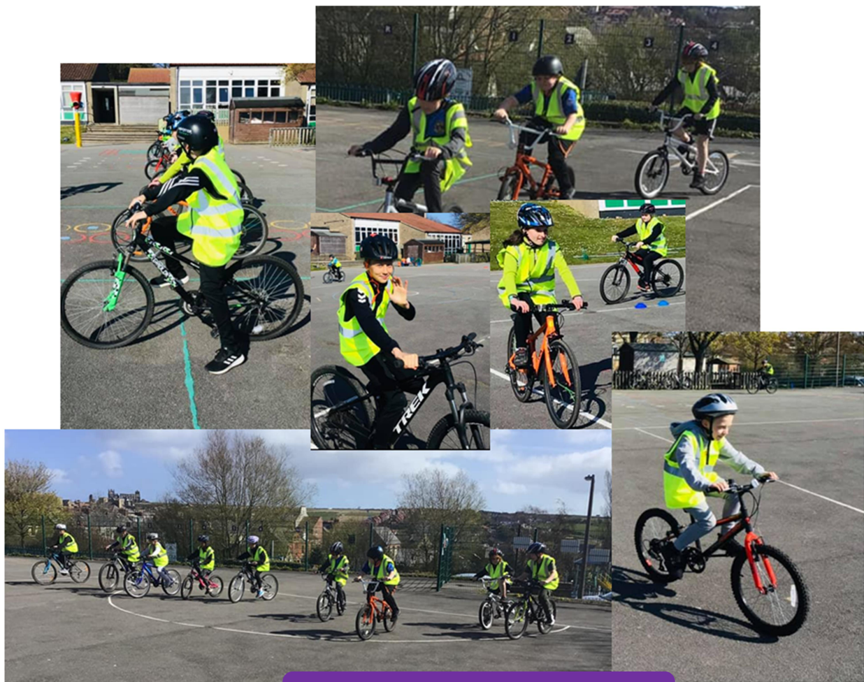
Bikeability at Airy Hill

Our Year 6 children have been busy developing independence this term in preparation for the move up to secondary school. Last month, all children took part in a two day 'Bikeability' training course to prepare them for safe practice on the roads. We are so proud of our Year 6 children and we can't believe we only have a few weeks left with them - they are growing up so fast!