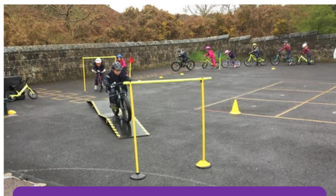
Mountain Biking Skills at Glaisdale