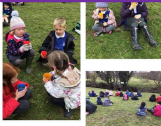
Mmmmmmm hot chocolate!

our passionate about keeping our local area clean and tidy.