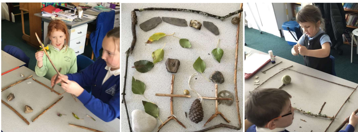
Children from Lealholm making their own natural pictures and frames using materials they found exploring the school surroundings during Forest School.