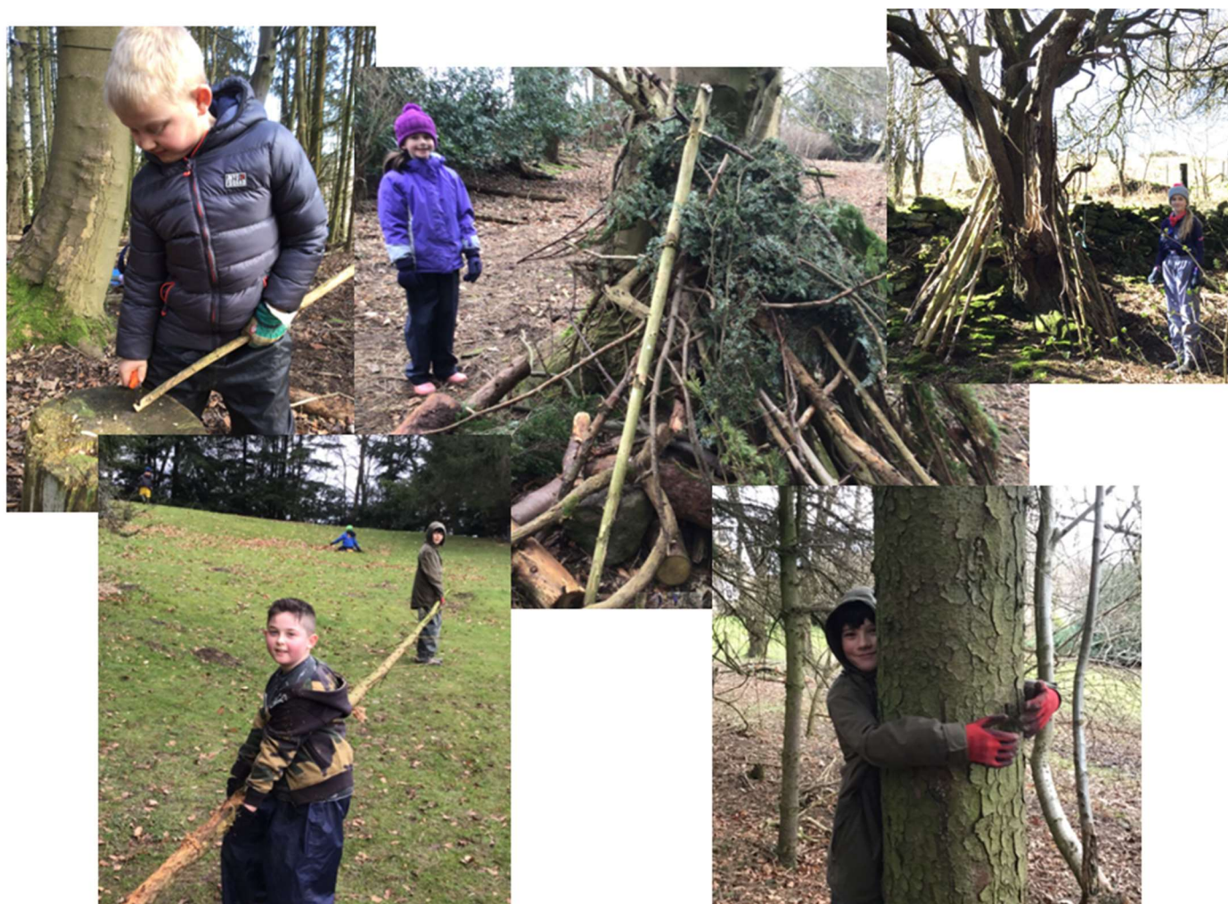
Children from Castleton enjoying the outdoors in Forest School!