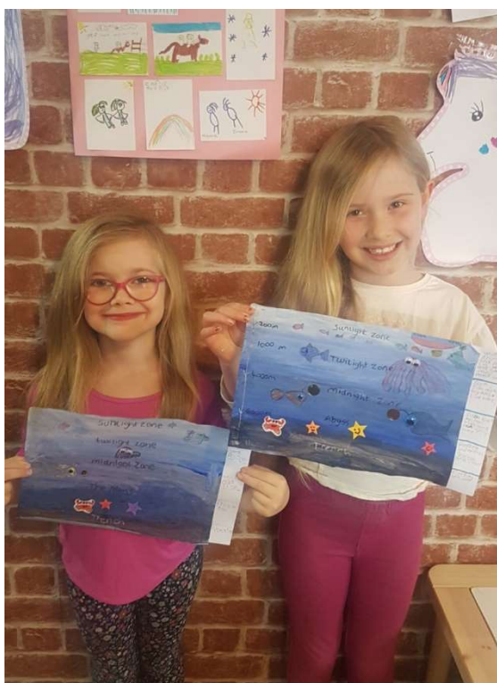
Glaisdale pupils' artwork on a journey to the bottom of the sea!